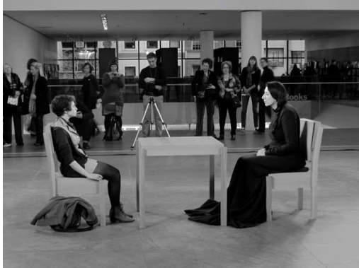
Marina Abramovic, MoMa 2010 'The artist is present'

After two weeks of general research this is your last chance to gather the information that you might feel is still lacking. The SWOT analysis and writing of a design assignment might help you to define what you still don't know about your target group and/or location. Maybe you need to involve your target group with an intervention? Maybe you have to do an experiment with your group? Maybe you have to rewrite your questionnaire, or do you have to quantify your observations ...?